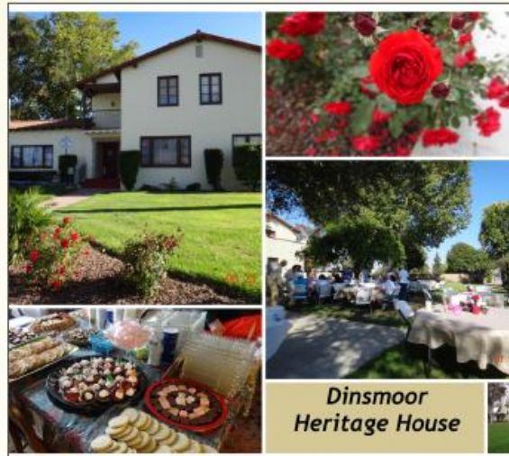
Dinsmoor Heritage House

The drawing of the house is by Ed Alejandro, who is listed in Who's Who in the West, 1982. This artist and preservationist's skillful rendering captures architectural exactness and essence of the structure better than the most